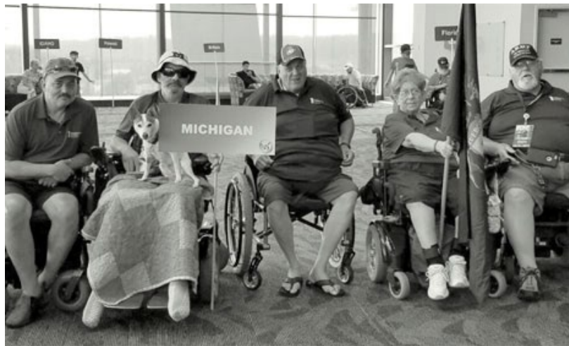
Some members of the Michigan Chapter of Paralyzed Veterans of America

Equipment Donation Program focuses on the needs of people with spinal cord injury or disease. We only accept items that help people with mobility issues. For example, we accept donations of wheelchairs, power chairs, adaptive sports equipment, hoists, lifts, and other items that help people who cannot easily move.