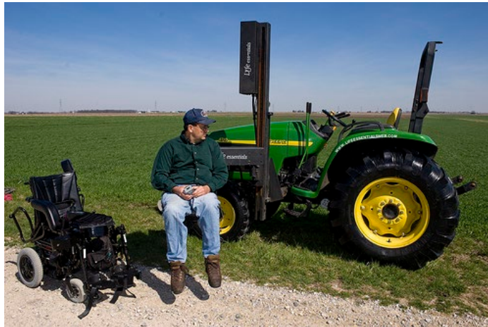
A man using a chair lift provided by AgrAbility to get onto the tractor

ESM-AgrAbility staff helps farm operations adjust to and manage disabling conditions, such as, arthritis, chronic back pain, joint injuries, amputations, spinal cord injuries, hearing loss and any other condition that may limit a farmer's ability to work. Information and referral services and farm-site assessments are offered at no cost to the farmer. The cost of new equipment or modifications made to old equipment, the farm operation, or the farm home is typically covered through the state via Michigan Rehabilitation Services. ESM-AgrAbility staff will help the farmer navigate the state system to access these supporting funds.