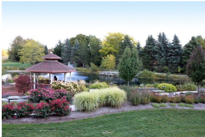
Leland and Opal Peck Memorial Garden at Eaton Community Palliative Care Residence and Offices

Equipment may include chair lifts, walkers, wheelchairs, grab bars, commodes and more. Limited supply, please call in advance to check current stock. Provider also receives donations of bed pads, diapers and other care items on limited basis