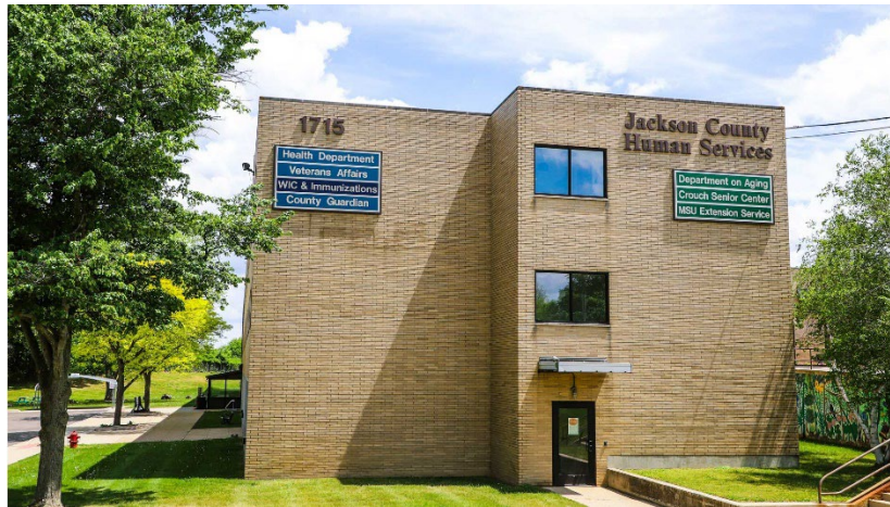
Department on Aging located inside Jackson County Human Services building

Walkers, canes, wheelchairs and tub seats (For tub seats, seniors with lower incomes served, as supply permits.) Please call to check for availability.