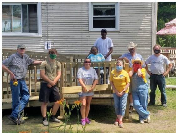
Jackson County disAbility Connections building a ramp for a community member

We do have an application process where people who have financial limitations can request assistance without payment. This can discount the cost down to zero depending on income.